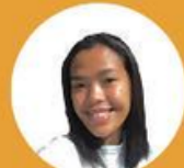
KAYE Nueva Viscaja II