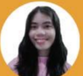
JEZREEL Nueva Viscaja I