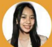
RAPHA Nueva Viscaja I