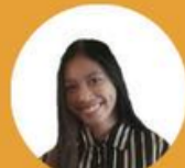
WORTHY Nueva Viscaja III