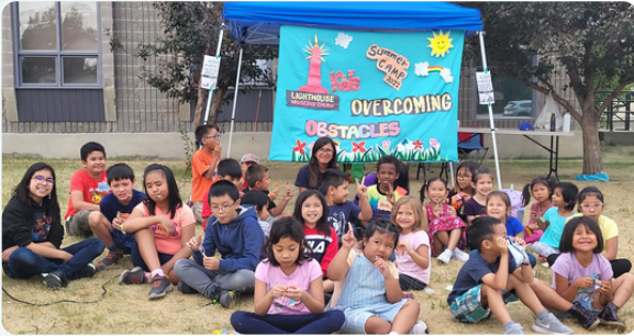
KID'S DAY CAMP

LM has taken great strides to grow a healthy relationships between one another. We organized events that will deepen our connection with God through spending quality time together as a family.