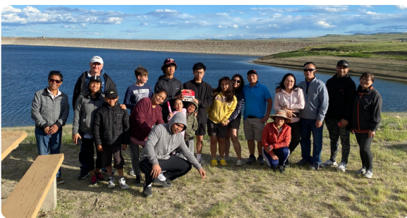
MEN'S FISHING EVENT