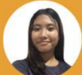
GEMINI La Union