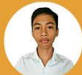
ELI Nueva Viscaja III